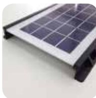
Dust Removal/ Wind Ventilation