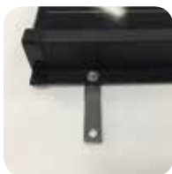
Easy Installation By Pull-Out Fitting