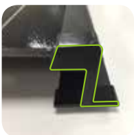
Smart Z-type Frame

Features: dust removal, wind ventilation, anti-moisture, mechanical stress simulation, and durability test.